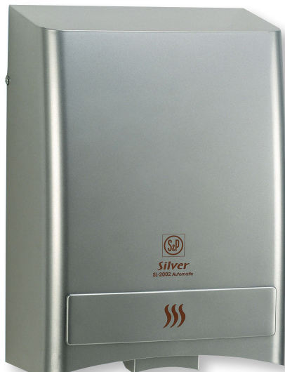
SL-2002 AUTOMATIC SILVER

Warm air hand dryers, security device to avoid continued function if an object is left below. Fitted with thermal overload protection in the motor and the heating element.